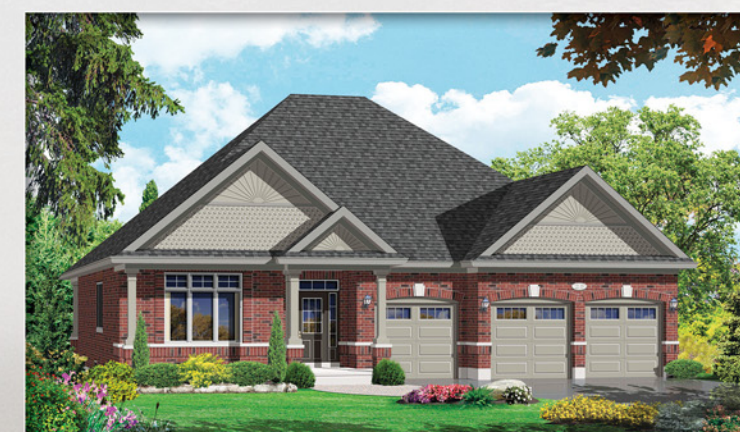
ELEVATION - B