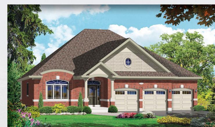
ELEVATION - A